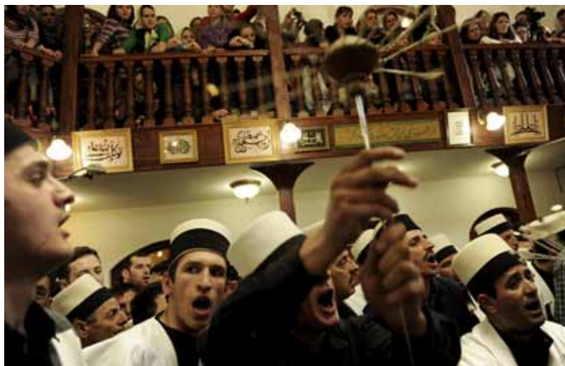
A traditional Sufi ceremony takes place in a prayer room in Rahovec, Kosovo.

and, in some instances, even with militant causes. Many Sufi orders place a great deal of emphasis on shari’a (Islamic) law and the strict observance of orthodox requirements in the areas of worship and social affairs. Moreover, given the pre-eminent position of the shaykh or leader, the orders can be rather authoritarian and rigidly hierarchical. For example, the most devoted followers of an order (known as murids ) are expected to follow the leader’s directives without question.