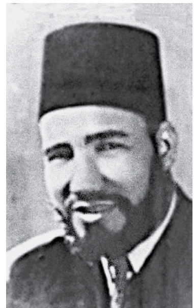
Hassan al-Banna, the schoolteacher who founded the Muslim Brotherhood in Egypt in 1928.

By the 1950s, the secular nationalist regime of Gamal Abdel Nasser in Egypt came to view the politicized Islam of the Muslim Brotherhood as a major threat to the security of the Egyptian state, and suspected members of the group were imprisoned and in some cases tortured. In the decades that followed, governments in other countries where the movement had a following, including Syria, Iraq and Tunisia, began similar crackdowns on the Muslim Brotherhood, prompting many members of the group to seek refuge in France, Germany, Switzerland, the United Kingdom and other places in Europe.