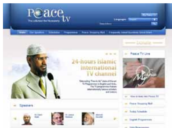
Peace TV home page.

Another important figure with a European following is Zakir Naik, a Mumbai-based speaker on Islam and comparative religion. Founder of the satellite television channel Peace TV, Naik is a medical doctor rather than a classically trained religious scholar. While he is not an Islamic legal expert, Naik has impressed many young people (particularly young South Asians in Britain) with his ability to address contemporary issues using a combination of common sense and an encyclopedic knowledge of the Quran and other Islamic sources. He also has established himself as an Islamic polemicist, peppering his discourse with frequent comparisons between Islam and other religious traditions (he is equally comfortable recalling direct quotes from the Bible), always emphasizing that Islam is superior to other religions.