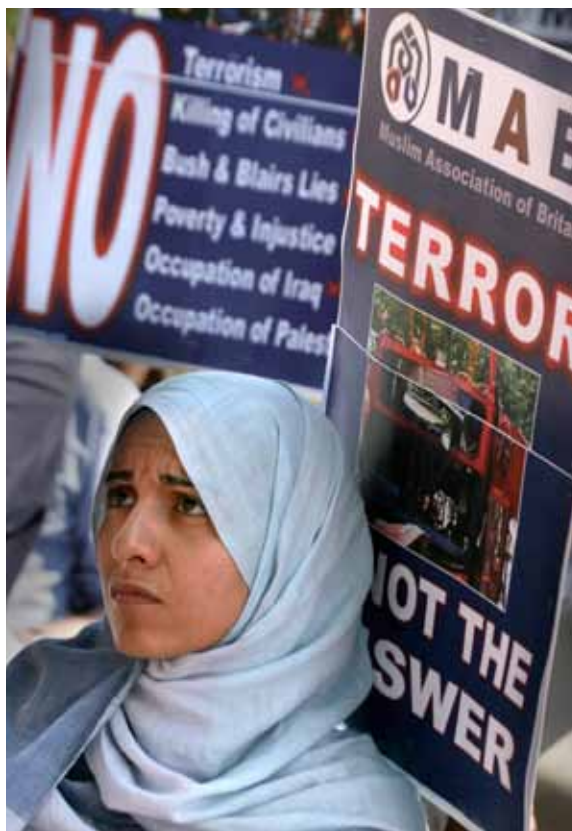
A Muslim woman at a rally in London on July 17, 2005, organized by the Stop the War Coalition and the Muslim Association of Britain.