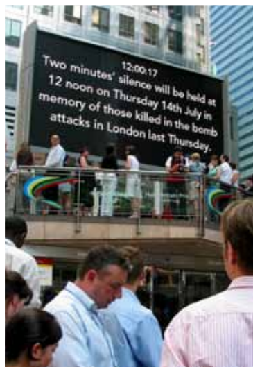
Office workers at London's Canary Wharf observe a two-minute silence in memory of the victims of the July 7, 2005, bombings one week after the attacks.

Radical Islamist movements also differ from broader currents of Islamist activism, such as that represented by the Muslim Brotherhood. While the movements share certain ideological roots, followers of the Islamism associated with the Muslim Brotherhood are, for the most part, committed to working within existing political and legal systems. Indeed, Islamists and jihadists increasingly find themselves at odds rather than working in consort. In fact, some Brotherhood-linked groups have worked with European security services to curb the influence of radical groups. In addition, several new Muslim organizations – including the Quilliam Foundation in London and British Muslims for Secular Democracy –