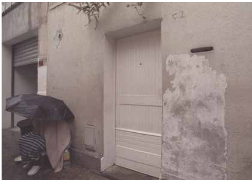
A Tablighi follower sits outside the Tablighi center in St. Denis, France.

of North African origin. In France, there is a major Tablighi center in St. Denis, outside of Paris, but most Tablighi groups in the country operate independently, primarily by building relationships with local mosques.