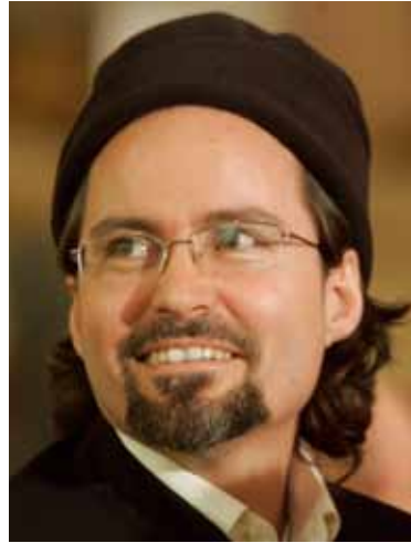
American Sufi scholar Hamza Yusuf Hanson.

In the face of what is often experienced as an onslaught of competing and sometimes contradictory views on religion available through the Web and other new media channels, some Muslims have found that affiliation with a Sufi order offers an appealing alternative: a single, reliable source of information on Islam that comes with a personal spiritual guide. 40 The new wave of enthusiasm for Islamic mysticism suggests that this tradition will continue to have a pervasive influence across Europe's Muslim communities.